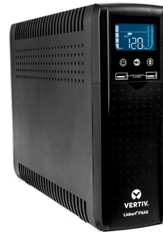
Vertiv™ Liebert® PSA5 UPS