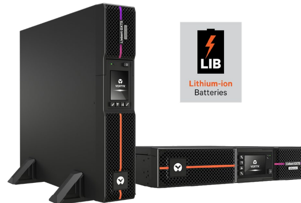
Vertiv™ Liebert® GXT5 UPS