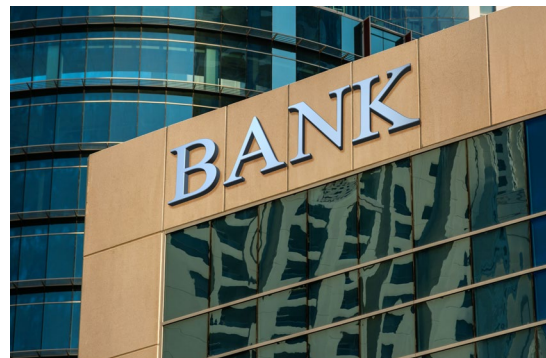
Banking and Financial Institutions