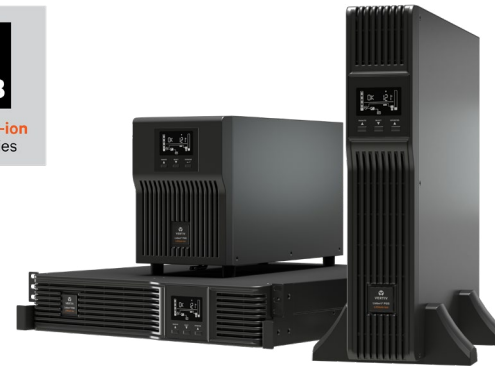
Liebert® PSI5 UPS Li-ion