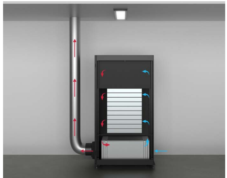
Vertiv™ VRC installed in rack rejecting heat to ceiling plenum