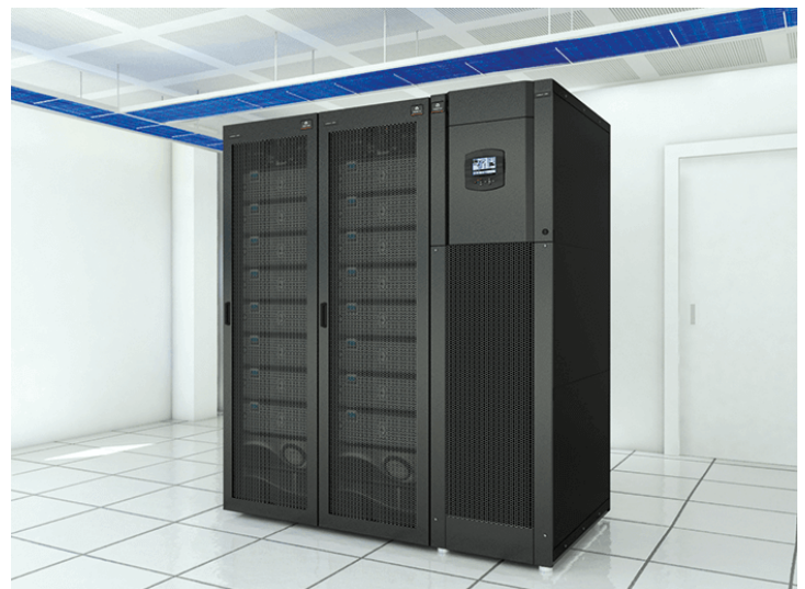
Liebert® CRV in small room application